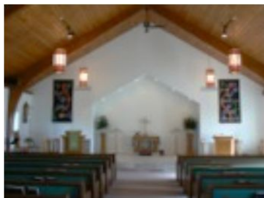
Trinity Sanctuary Remodel Phase 1

Visit the parish website at http://trinityrec.org