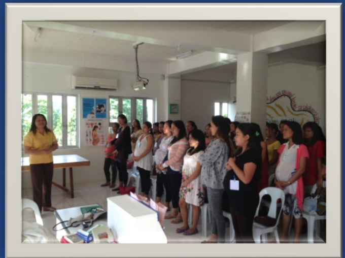
Praying with the patients at the pre-natal clinic