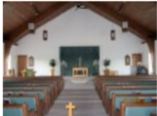
Trinity Sanctuary Before Remodel

Trinity recently completed Phase I of a project to remodel the chancel. A new area was created from space that had included storage rooms and an unused baptistry. The expanded and brightened area includes a stone chancel floor and is a daily reminder of the church's dedication to worship and the sacraments as the central focus of the congregation's ministry to the community.